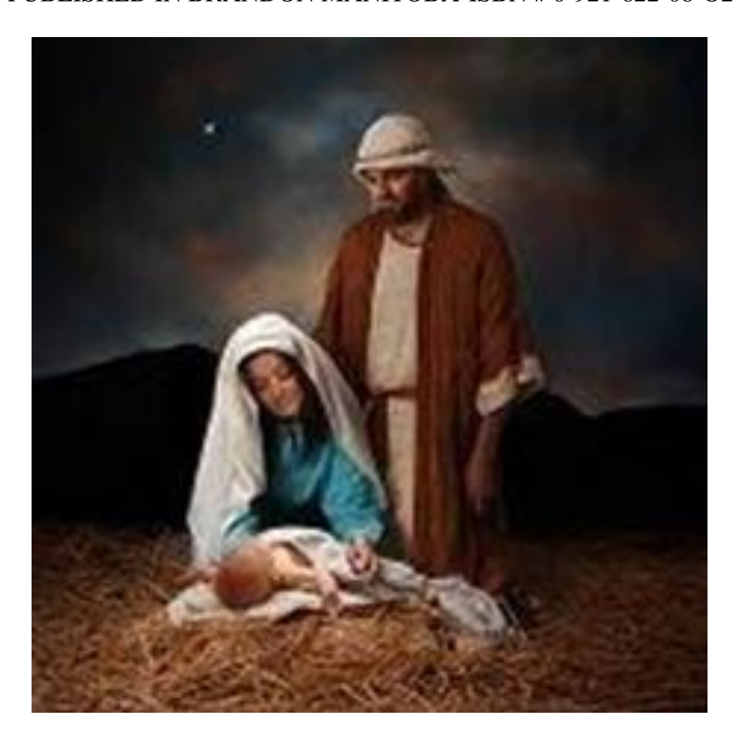
THE REASON FOR THE SEASON

NEWSLETTER OF THE SOUTH WEST BRANCH OF THE MANITOBA GENEALOGICAL SOCIETY PUBLISHED IN BRANDON MANITOBA ISBN # 0-921-622-08-02